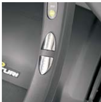
Speed and elevation remote controls with integrated contact heart rate