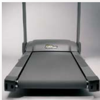
Sizable, cushioned running base